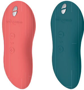
Crave Coral Green Velvet